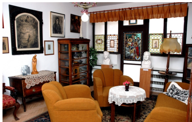
Permanent exhibition area -Vojtech Löffler's room.

and is a lasting testimony to his works that are on display In its permanent exhibition area.