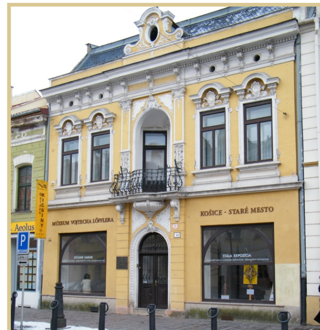
The building of museum.

A theme prevalent in his works, however, is that of a woman, interpreting various moments from her life. Formally, Löffler's sculptures always favour precise craftsmanship and regard the beauty of the material itself. Löffler's smaller sculptures and compositions, often made of precious materials such as ivory, coral, amber or silver, are equally interesting and masterfully executed.