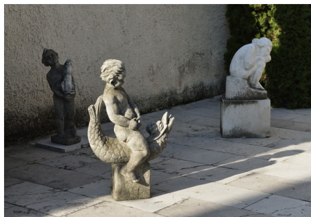
Courtyard in museum.