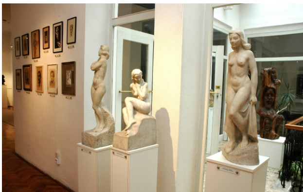
Permanent exhibition area - Vojtech Löffler's work and collection.